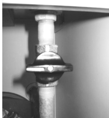
Do you know where the main valve of the gas supply is?

We have lots of earthquakes in Japan. Are you always prepared for it? First, make sure you are safe, then turn off all sources of fire and evacuate to the shelter. These are the main points of this issue.