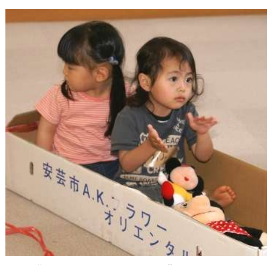
"Play in the corrugated box" from last meeting

Annual BIG EVENT Fujimi-shi "International Cultural exchange forum" Oct. 15<sup>th</sup> (Sun.) at Fujimino Koryu Center (10minutes walk from Fujimino station) 12:00~16:00