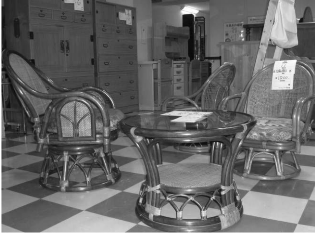
▲Display space of recycle products for lottery held in 16 th every month

☆Recycle Plaza Risaikan 480 Katsuse, Oji, Fujimi City. Phone & FAX 049-254-1160