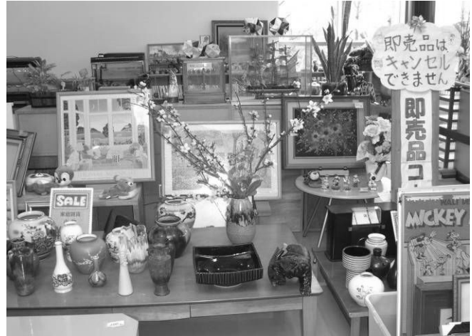
▲space for super-low price products