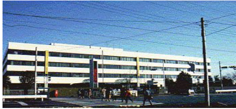
Saitama Pref. Driver's License Center 5 minutes by bus or 20 minutes walk from Konosu Station East Exit. Tel: 048-543-2001