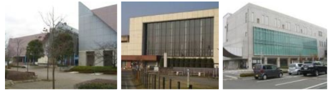
Fujimi City gym Fujimino City gym MiyoshiTown gym

Gym is a dream open space which helps you health care, stress reduction and getting companion. It would be possible for habitants to use any gym located in 2 cities and 1 town, even if the area is different because of agreement concluded for mutual use. The habitants can choose any of three gyms even if the area is different. Habitants who would take exercise, compete in sports with companion are welcome. Please enjoy variety of sports in dream open space. Contact the following for further enquiries. Fujimi Gym 049-251-5555, Ooi Gym 049-261-2611, Miyoshi Town Gym 049-258-0311