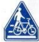
Pedestrians · Bicycle Crossing

③A bicycle rider is recommended to ride on a sidewalk, because of under construction.