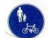
Cycling & Pedestrians Only