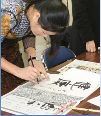
On Jan. 12: Experience of first calligraphy of the year, using a writing brush and the ink